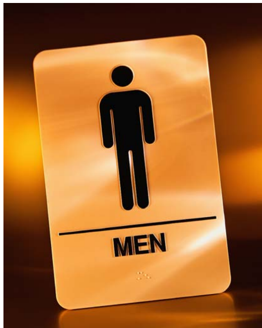
MEN'S BATHROOM or BOY'S BATHROOM