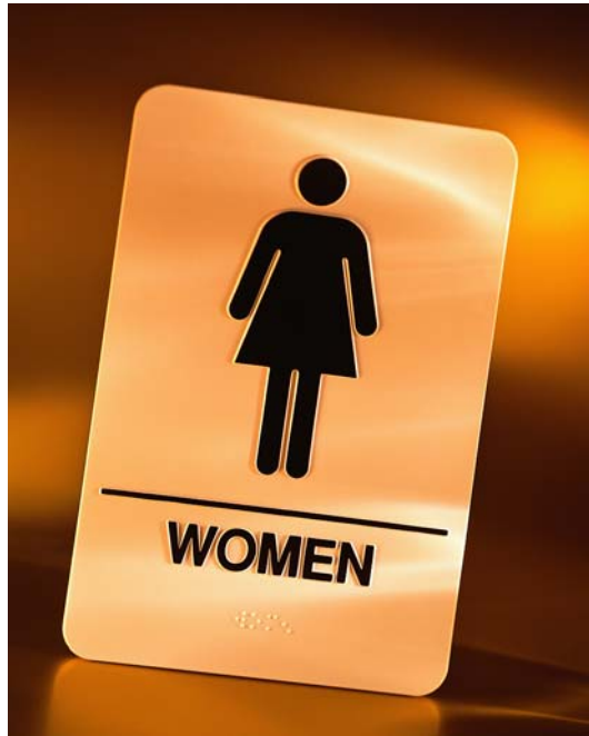
WOMEN'S BATHROOM or GIRL'S BATHROOM